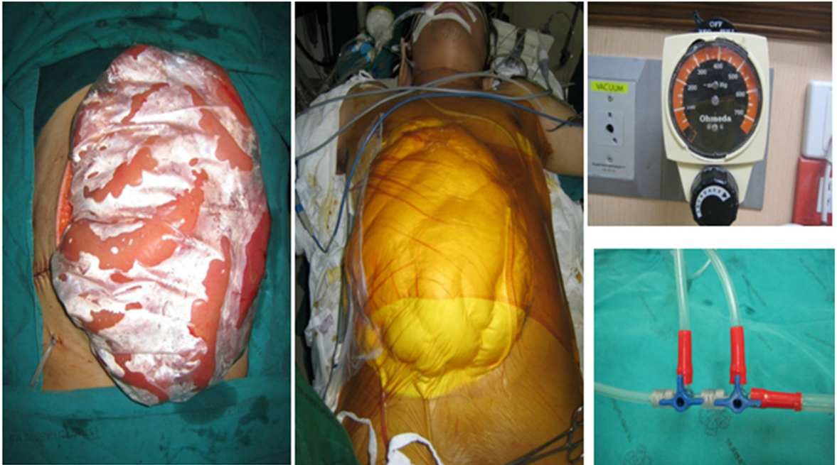
Figure 3 Vacuum pack (sandwich technique) a perforated plastic sheet placed over the abdominal viscera followed by a sterile moist gauze and tube drains then covered with iodophor-impregnated-polyester drape. The tube drains were connected to wall suction

The indication for temporary closure was determined by using the operative note or as stated in the medical records. The indications were classified into four categories: (1) damage control surgery: when the abbreviated procedure was carried out on patients in extremis, followed by stabilization of the patient in the intensive care unit for 24 to 48 hours, then transfer of the patient back to the operating theater for the definitive procedure; (2) planned reoperation: when a second look procedure (e.g., to reassess bowel viability, to change the dressing in a contaminated peritoneal cavity); (3) inability to close: when fascial necrosis or fasciitis had occurred or the surgeon felt fascial closure would involve too much tension; and (4)