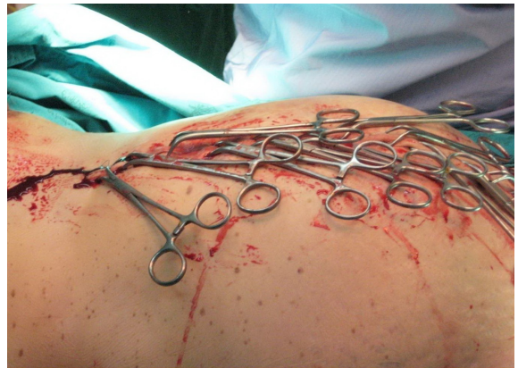
Figure 1 Temporary skin closure by towel clips

over the abdominal viscera followed by a sterile moist gauze and two tube drains then covered with iodophor-impregnated polyester drape. The tube drains were connected to wall suction with negative pressure applied at about 80-100 mmHg. (Figure 3).