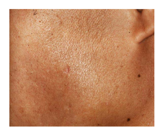
Figure 1B The lesion had completely cleared after one month of oral indomethacin 75 mg/d