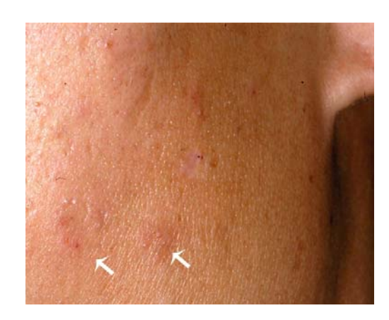
Figure 1A Erythematous papulo-pustule, annular configuration on the left cheek

As Figure 1A shows, by May, 2006 the patient's face had erythematous plaques studded with papules and pustules formed in annular configurations located on the left cheek. Both a KOH preparation for fungal hyphae and an HIV test showed negative. A CBC showed leukocytosis (WBC 11,850/mm³) and eosinophilia (3.5%). Additionally, a skin biopsy from the left cheek was done, whereupon the histopathology revealed folliculitis with infiltration of lymphohistiocytes and eosinophils. (Figure 2) A diagnosis of classic EPF was made based on the typical clinical and histological findings, and indomethacin treatment was prescribed. All eruptions cleared with oral administration of indomethacin 75 mg per day for four weeks (Figure 1B) after which he was treated with indomethacin 25 mg per day. At a one-year follow-up there was no recurrence of the lesions observed.